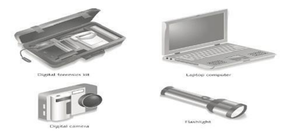
Fig: Items in an initial Response field kit